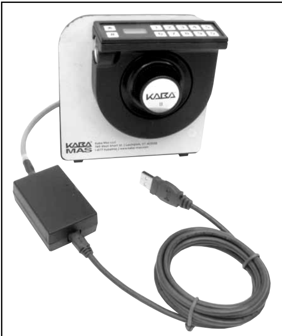
The Interface Box is only for use with the Gen2 Cencon lock.

For assistance, contact Kaba Mas Technical Support: CustomerService@KML.kaba.com + 1 (859)-253-4744 1 (800) 950-4744