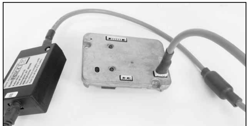
Use of the Interface Box does not require the lock to be installed.