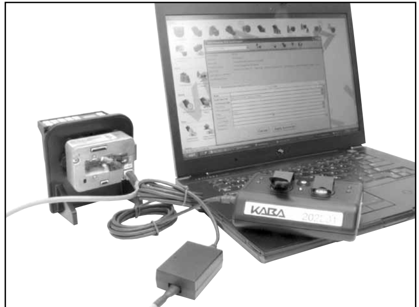
The Cencon 4.0 software and a USB Key Box are also required.