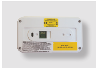
Desktop Version Part Number #7542500001