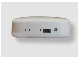
Wall Mount Version Part Number #7542800001