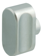
Oval knob (D-Line)