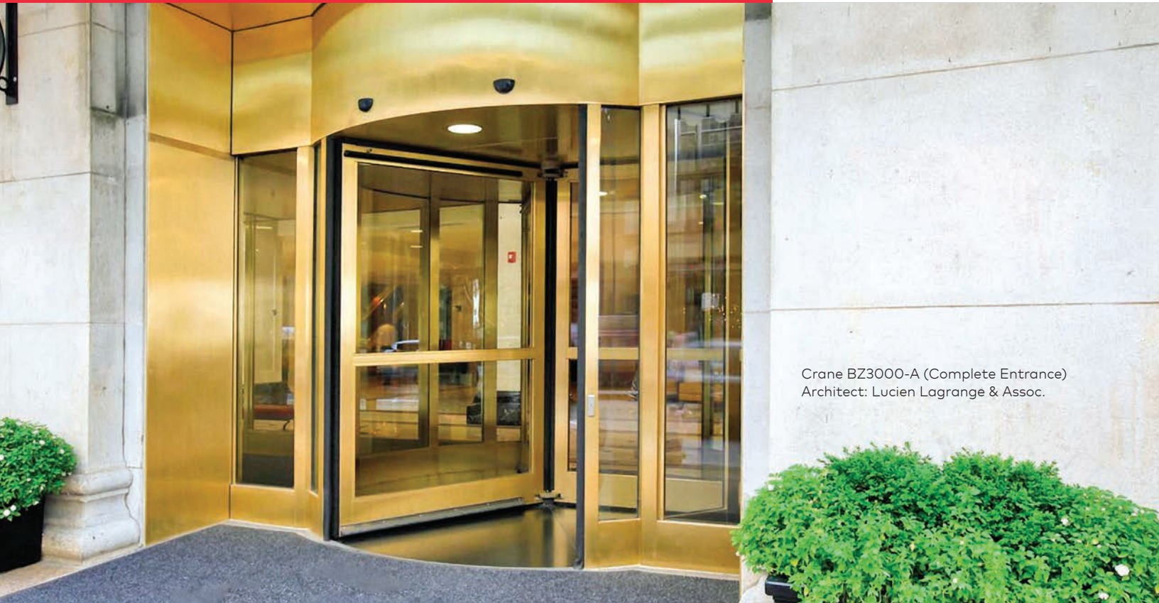
Crane BZ3000-A (Complete Entrance) Architect: Lucien Lagrange & Assoc.

The 3000-A Series features the torque-driven Crane Modular Drive System. The reliable advanced microprocessor control monitors the door and occupants to ensure safe operation.