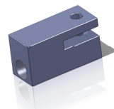
M8 rod connector No 4130 (optional)