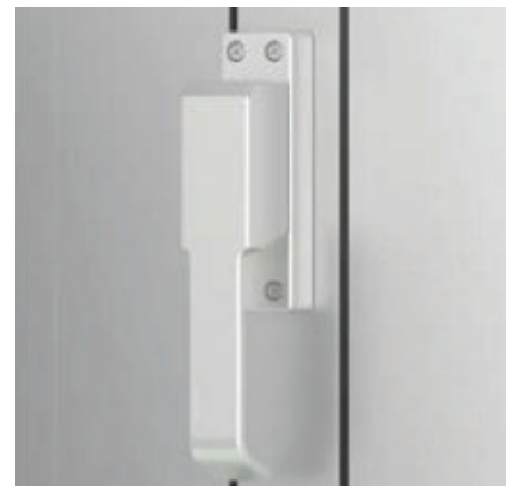
A simple lock bar for switching from the sliding to the door function of convertible panels

The HSW-FT offers unmatched versatility. It's fully framed design offers high acoustical rating, and strong thermal protection. With virtually unlimited stacking possibilities, you can effortlessly create or expand rooms as needed. The convertible panels with built in closers are transformed from sliding panels to swing doors with a simple turn of the wrist.