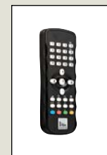
DX3336-033 BEA UNIVERSAL REMOTE CONTROL