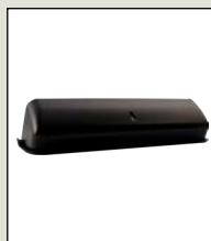
DX3336-025 RAIN ACCESSORY