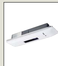
DX3336-024 FLUSH MOUNT CEILING ADAPTER