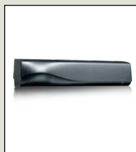
DX3336-012 DUAL TECHNOLOGY SENSOR