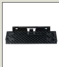
DX3336-021 MOUNTING BRACKET ADAPTER