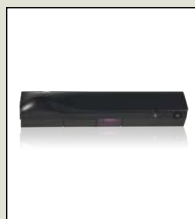
DX3336-061 DUAL TECHNOLOGY SENSOR WITH VIDEO