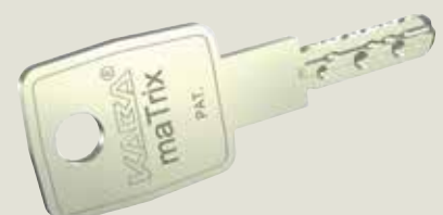
dormakaba armour bow, customer coinage available

Kaba matrix keys can be produced on Silca Matrix machines, provided that they are properly used and operated at all times. dormakaba offers only general recommendations regarding the proper use of Silca Matrix, but cannot take responsibility for the results of the key cutting. The fulfilment of the dormakaba quality criteria remains the absolute responsibility of the key producer (ie. the dormakaba Partner).