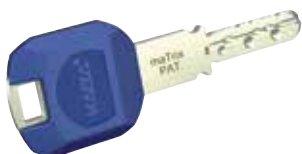
The Kaba matrix „LargeKey“ is ideal for long rosettes and multiple point locks