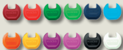
12 different key clip colors help in organization

Kaba matrix lock cylinders are upward compatible to the mechatronic Kaba evolvo system. Replacing the key clip with an electronic chip makes the key an electronic access control medium that aside from its mechanical keying can also be used for time and data recording, cash free vending and as an identification medium in electronic access control systems.