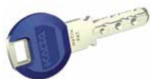
Kaba matrix „SmartKey“

The dealer code of Kaba matrix keys are manufactured in a CNC controlled slideway milling method guaranteeing highest precision. They are characterized by a high level of security, minimum wear and are highly reliable.