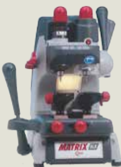
Silca Matrix SLX key milling machine

The standard SmartKey clip is available in twelve different colours. The LargeKey clip with seven different colours and the armour (long) key bow are suitable for security door hardware and multiple point door locks.