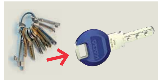
With Kaba matrix the key ring becomes noticeably lighter.