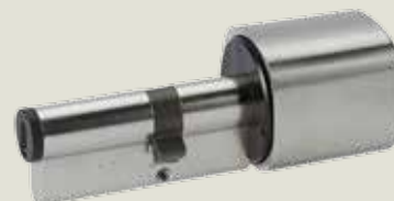
Kaba matrix can also be integrated into mechatronic master key systems