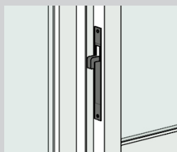
Multipoint electric lock Activated in lock & exit mode to ensure doors cannot be prised open