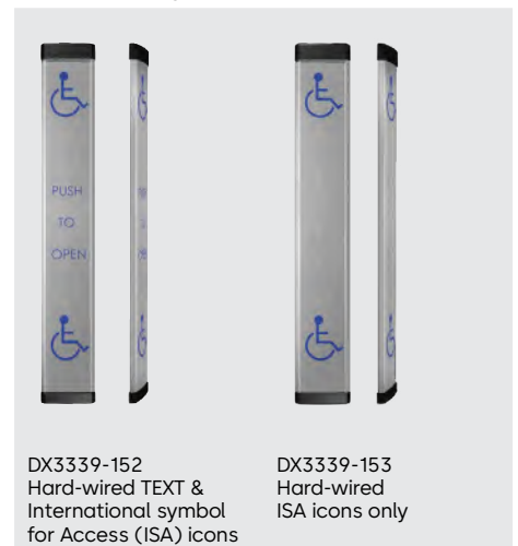
DX3339-152 Hard-wired TEXT & International symbol for Access (ISA) icons