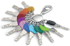
For the default key , there are Smartkey clips in 12 colours.