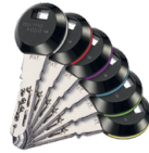
The RFID transponder clips have 6 coloured ring elements for easier identification.