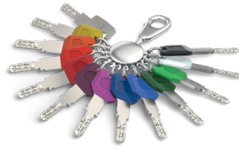
The key with Largekey clip is available in 12 colours.