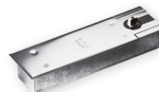
High-grade, stainless-steel cover