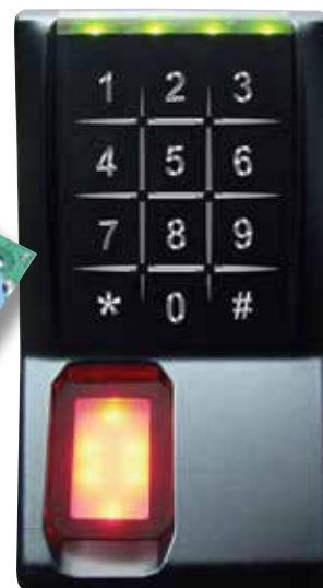
Fingerprint Key (AR402)