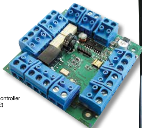
Standalone Controller (AD102)