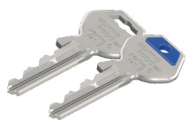
Standard key with angular bow, side locking element and optional mini clip