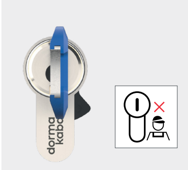
Keyway in normal position: 6 o'clock

In the service position (8 o'clock) the lock cylinder can be opened and locked from outside and inside by the service and proprietor keys. The key retraction position cannot be changed with the service key.