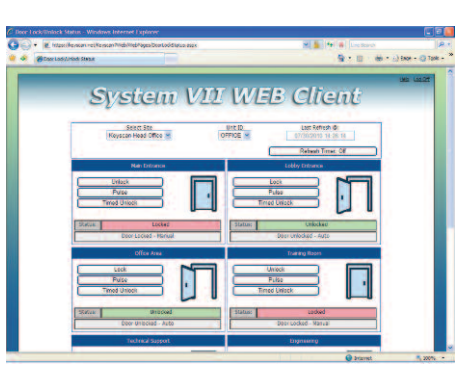
Door status control