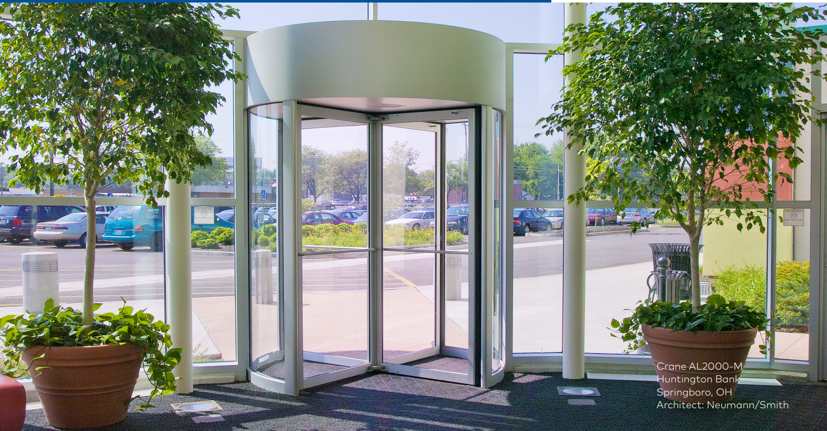
Crane AL2000-M Huntington Bank Springboro, OH Architect: Neumann/Smith

The Crane 2000 Series door is a cut above the already high standards set by the Crane 1000 Series door.