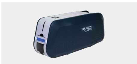
K-SLD310S Single-side Printer