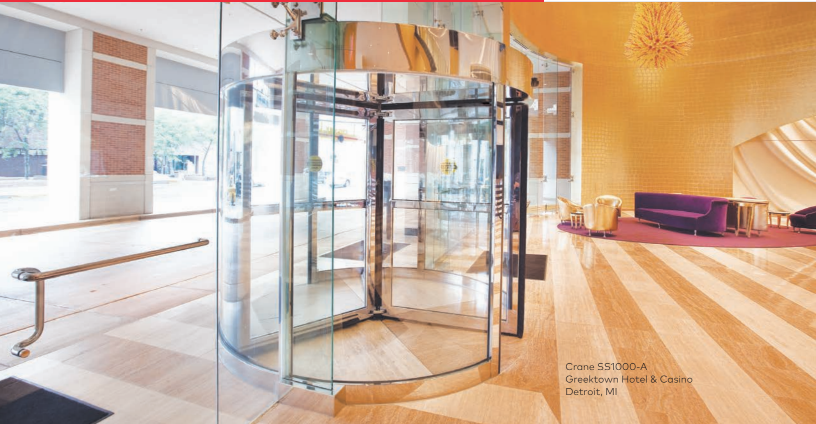
Crane SS1000-A Greektown Hotel & Casino Detroit, MI

The Crane 1000 Series door sets the industry standard for revolving door design, construction, operation, and reliability.