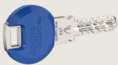
Default key with blue clip