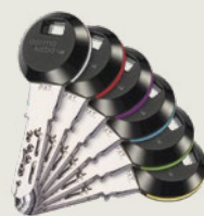
The RFID transponder clips have 6 coloured ring elements for easier identification.