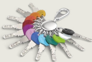
For the default key , there are Smartkey clips in 12 colours.