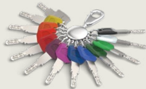
The key with Largekey clip is available in 12 colours.