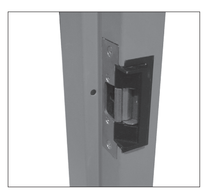
Secure the strike to the frame as per strike installation instructions.

For a tighter fit, pre-bend the two long flange tabs before sliding onto the frame where space allows.