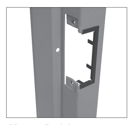
Adjust cut-out if required.

Position the Trim Plate on the frame cut-out to verify fit and coverage.