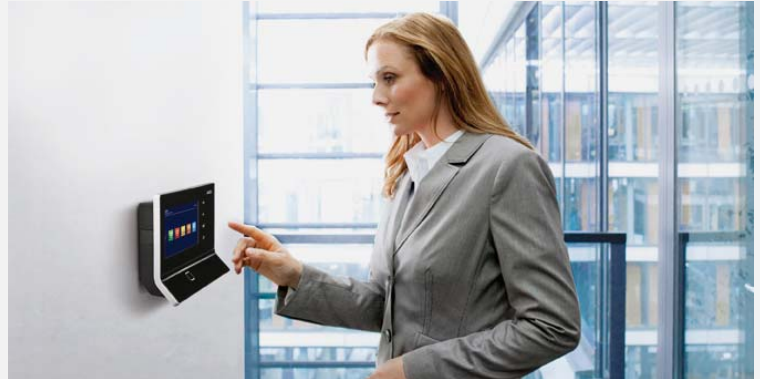
An Enterprise-class Solution B-COMM by Kaba