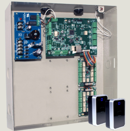
RAC5 MFC with RAC5 RFID readers