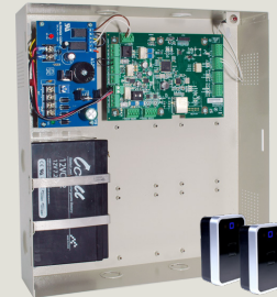
RAC5 XT with RAC5 RFID readers