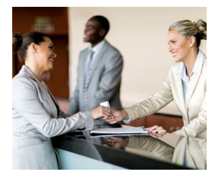
Your overall mobile strategy integrated with dormakaba technology delivers a more personalized and interactive guest experience.