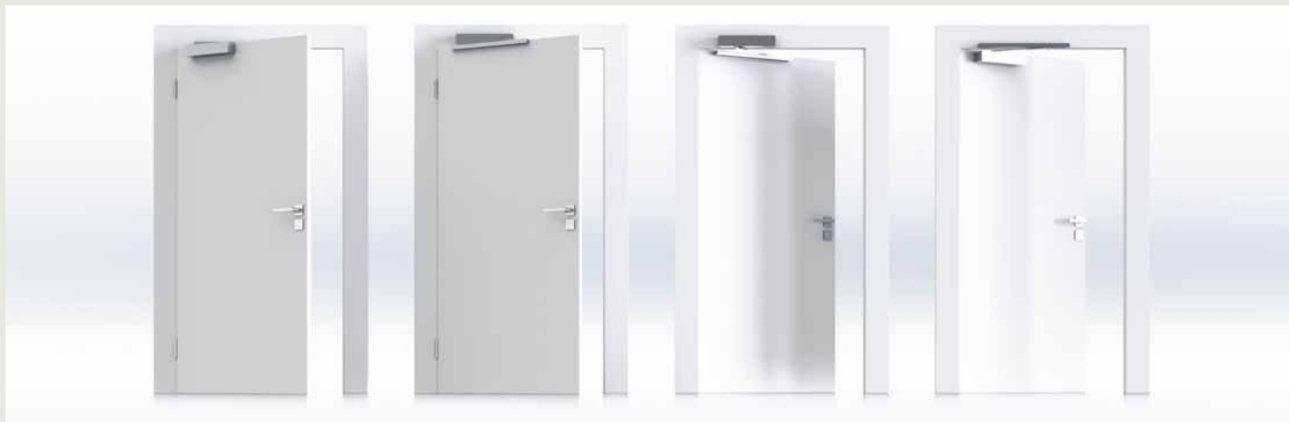
1. Door-leaf fixing pull side