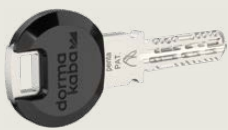
Default key with blue clip