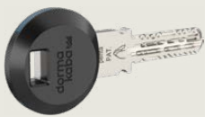
Key with RFID transponder clip for integration into electronic access control systems