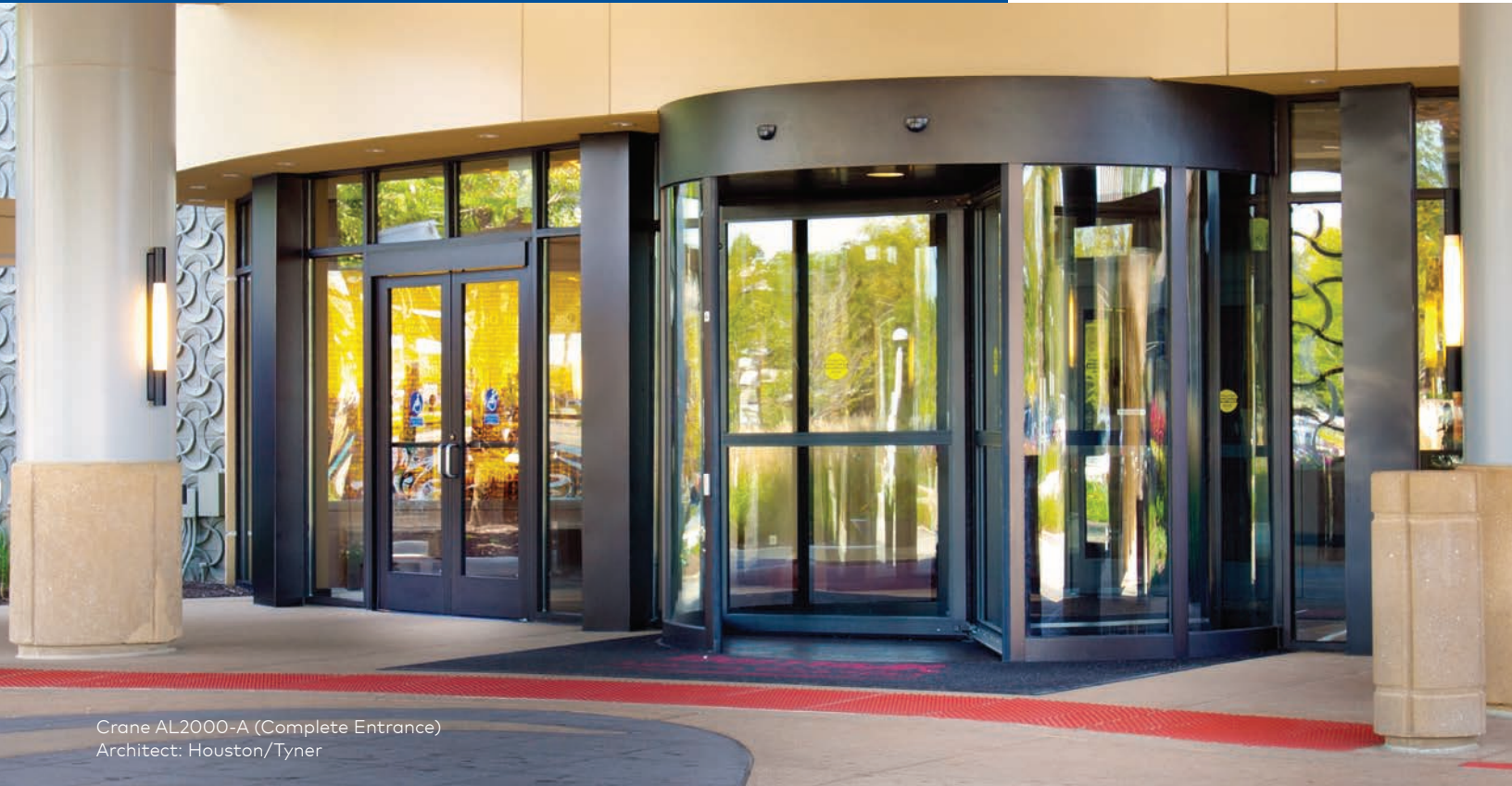
Crane AL2000-A (Complete Entrance) Architect: Houston/Tyner

The 2000-A Series features the torque-driven Crane Modular Drive System. The reliable advanced microprocessor control monitors the door and occupants to ensure safe operation.