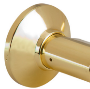
605/US3 Finish – Bright Brass