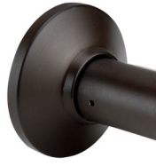
613/US10B Finish – Dark Bronze