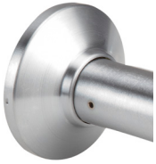
619/US15 Finish – Satin Nickel