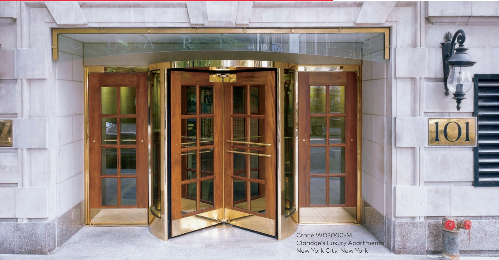
Crane WD3000-M Claridge's Luxury Apartments New York City, New York

Crane 3000 Series revolving doors combine premium construction with unmatched custom design.