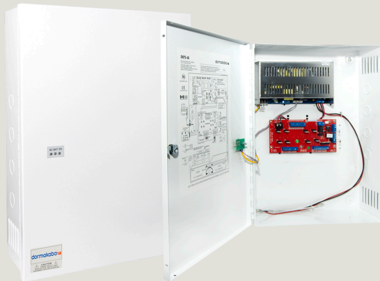
DKPS 4A Power Supply