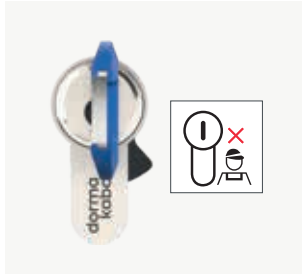
Keyway in normal position: 6 o'clock

In the normal (vertical) key removal position the lock cylinder can be operated from the outside by the proprietor key only.