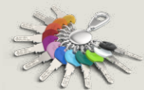
Smartkey clips (SK)

Broschure_SAT_GB_01/20 Subject to change without notice.