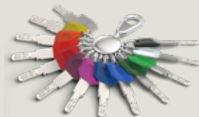
Largekey clips (LK)